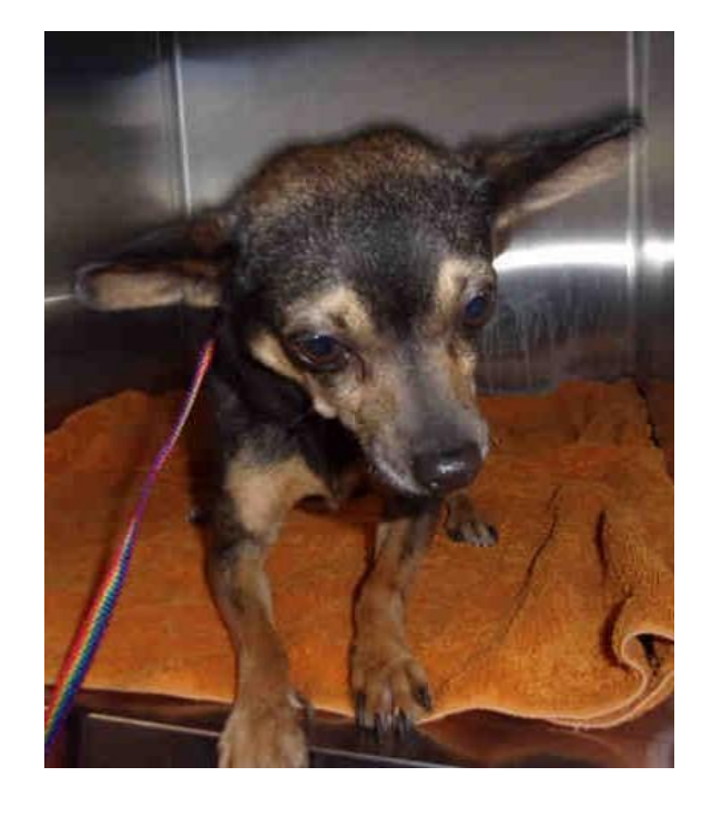
This DOG - ID#A104445 I a male, black and tan Chihuahua - Smooth Coated The shelter staff think I am about 1 year old. I have been at the shelter since Jan 25, 2018 This information is less than 1 hour old.