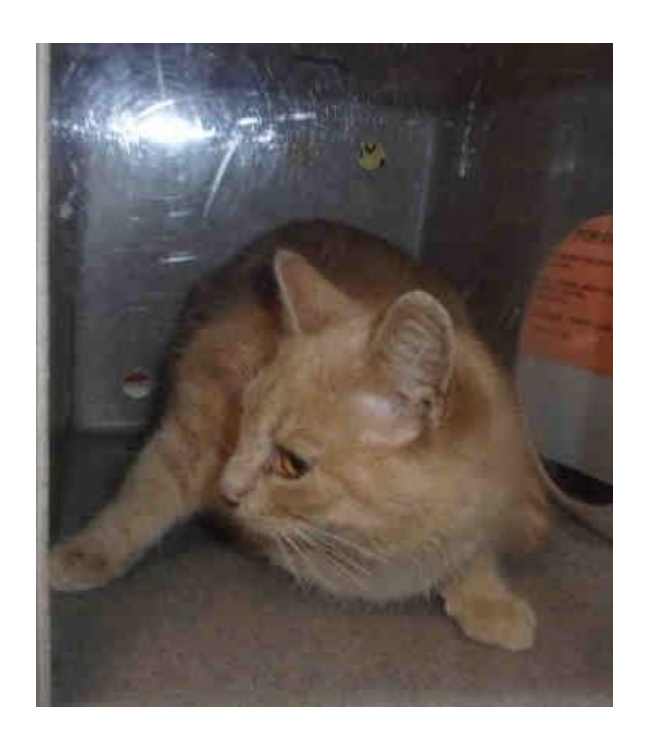
This CAT - ID#A104413 I am a cream tabby Domestic Shorthair The shelter staff think I am about 1year old. I have been at the shelter since Jan 23, 2018 This information is less than 1 hour old.