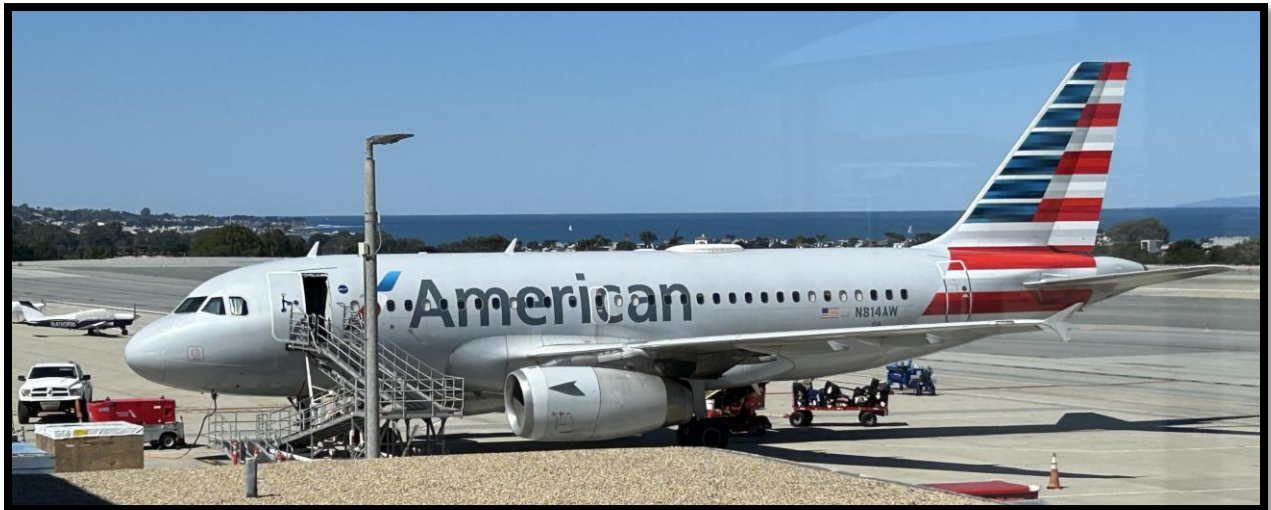
Commercial aircraft awaits servicing on the tarmac with North Monterey neighborhood and the Monterey Bay in the distance.