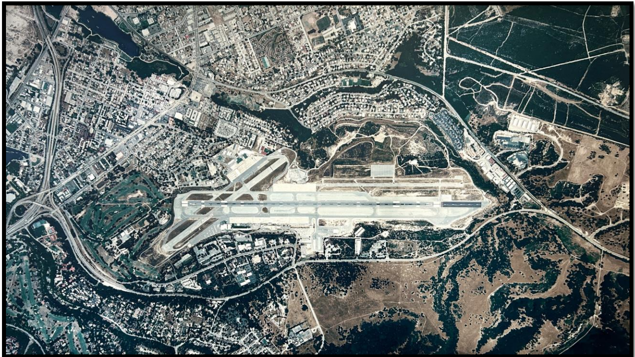
Aerial photography on display at Monterey Regional Airport.

MPAD has a distinguished history of providing the Monterey Bay area with a variety of services responsive to our community's air transportation needs.