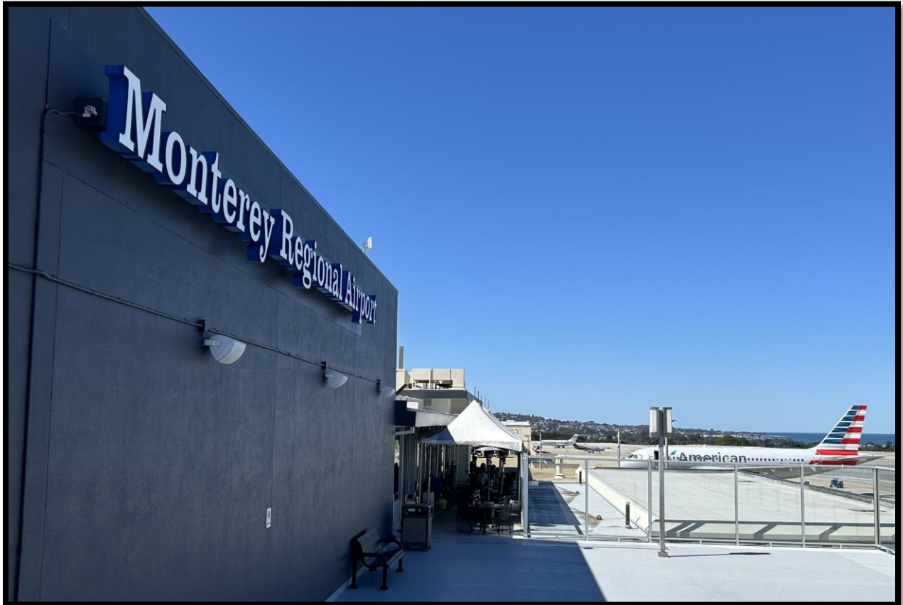
Commercial aircraft deplanes on tarmac with Monterey neighborhood in the background.

terminal is also designed to provide an electric system for recharging aircraft. This will eliminate the noisy, diesel-powered vehicles currently used for this vital purpose.